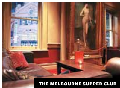
THE MELBOURNE SUPPER CLUB

Named for the Paul Simon song, this café on a suburban residential street is what Aussie 'brekkies' are all about. A cozy spot to enjoy a 'short black' (shot of espresso) or 'flat white' (a strong latte sans foam), and fuel up on creative dishes like rhubarb and semolina pancakes or a Spanish tortilla with house-made mayo. On weekends, locals come for the doughnuts, filled with jelly or lemon custard.